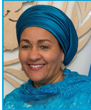
Her Excellency DR. AMINA J. MOHAMMED UN Deputy Secretary-General