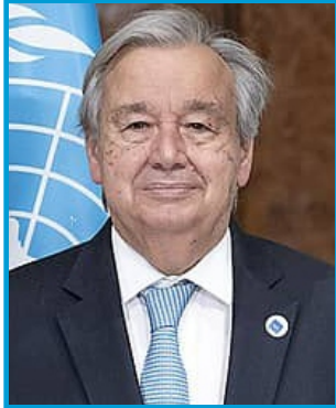
His Excellency DR. ANTONIO GUTTERES UN Secretary-General